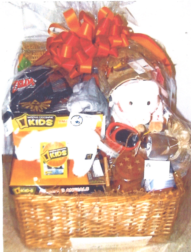
Donations from Redmond merchants fill basket to be raffled as a fundraiser to benefit the scholarship awarded annually to a graduating Redmond High School senior.